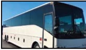
(3) 2006 Vanhool C2045's Detroit, Allison