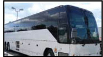
(1) '97 & 2004 Prevost H345's, Detroit Engines