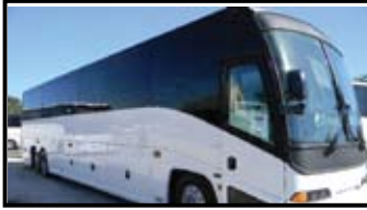
2004 MCI E4500 & 2005 MCI J4500 Det. S60, Allison B500