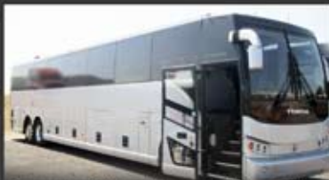
Cummins ISX / Allison B500 · 56 Pax. 85,000 miles · Warranty · CA Call for Price/Financing Package