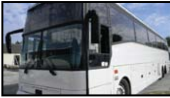
1998 - 2001 Vanhool T2145's Excellent Condition, Call for Pricing