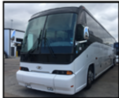
2008 MCI E4500 $189,000 VIN 64967. 56 PAX Detroit/Allison powertrain. 284,301 miles.