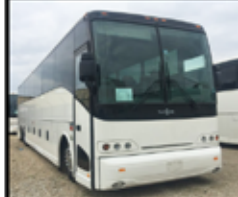
2005 VanHool C2045 Starting at $85,000 7 Available. 56 PAX. Detroit/ZF, Cummins/Allison mix.

For more information on these vehicles, contact your CH Bus Sales Account Executive.