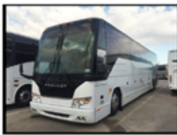
2007 Prevost H345 $159,000 VIN 10756. 56 PAX. Detroit/ZF powertrain. 482,183 miles.