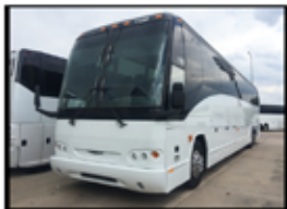
2008 Prevost H345 $189,000 each 2-like models available. 56 PAX. Detroit/Allison powertrain. <510k miles.