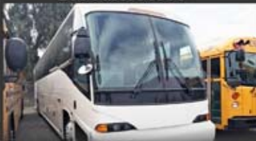
CAT/ZF · 780,000 miles · Passed DOT $43,000 in repairs, ready to work! · CA $99,000.00