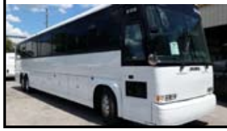
1996 MCI DL3's S60, Allison B500's Just came out of Service