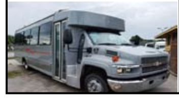
2004 - 2005 Minibuses BLOW OUT PRICES Call & Make Offer