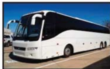
2013 VOLVO 9700 ~ 2 Available 54 Passenger/ADA, Volvo/shift, LOW MILES, DVD, 6 flat screens, Rust Free, Restroom—Clean Coaches