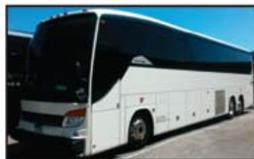
2012-2013 Setra S407 ~ 15 Available 56 Passenger/ADA, DD13/B500, LOW MILES, DVD, 6 flat screens, Rust Free, Restroom—Clean Coaches