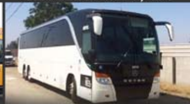
Detroit · Allison · 460,000 miles Passed DOT · Wheelchair Lift · CA $159,000.00