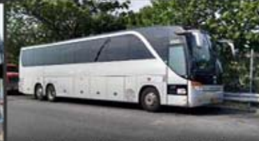
Detroit · Allison · 450,000 miles 56 Pax. Passed DOT · CA $159,000.00