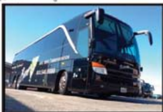
2004-2011 Setra S417 ~ 9 Available 56 Passenger, Series 60, B500 Transmission, DVD, 6 flat screens, Rust Free, Restroom—Clean Coaches