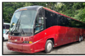
2008 MCI J4500 $179,000 VIN 64641. 56 PAX. Detroit/Allison powertrain. 464,589 miles.